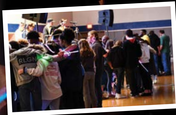
Left: Students gather after the sermon and concert Saturday, January 11. More than 20 students came forward for prayer and decisions related to their walk with Christ.